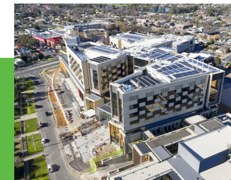
BENDIGO HOSPITAL BENDIGO, VIC

Bendigo Hospital is the largest regional hospital development in Victoria. Based on similar applications across similar hospital projects, EnviroSystems was selected to be the supplier of environmentally responsible waterproofing solutions for the Bendigo Hospital project.