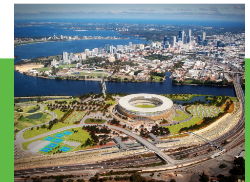
PERTH STADIUM PERTH, WA

The 60,000 seat Perth Stadium on the west coast of Australia is a world-class venue capable of hosting AFL, rugby union and league, football, cricket and entertainment events. Enviro 700 Series was installed on a variety of applications across this build including the exposed roof decks.