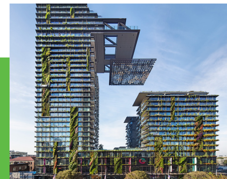
ONE CENTRAL PARK SYDNEY, NSW

One Central Park was a multi-stage $2 billion urban village, with a diverse collection of over 2,000 residential opportunities, parklands, shopping centre, retail and dining and entertainment areas. Our Enviro Series was installed to the balconies of the residential apartments.