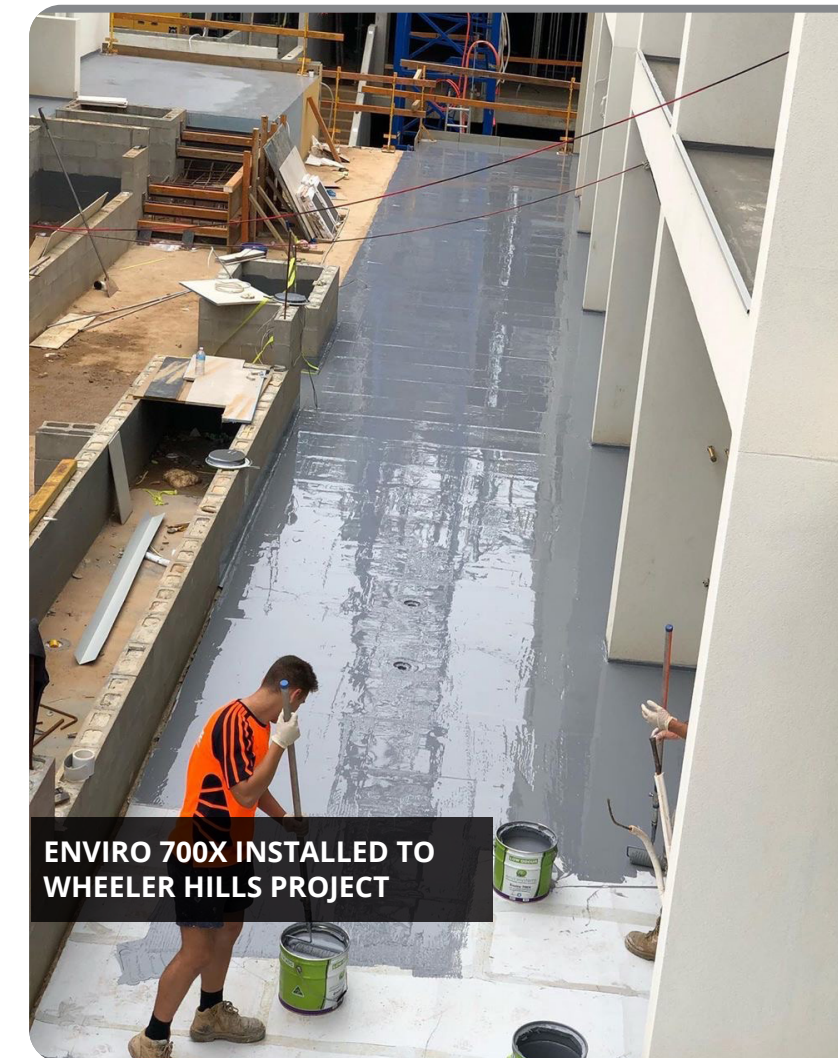
ENVIRO 700X INSTALLED TO WHEELER HILLS PROJECT

Being a single component membrane with a simple installation method, Enviro 700X is user-friendly and has become a staple for many contractors due to its all-around high performance and suitability for a wide variety of applications.